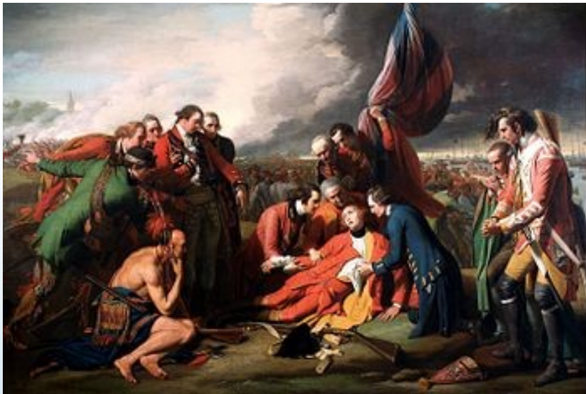
This painting is called The Death of General Wolfe .

Some Native American tribes fought as allies of the French, and some Native American tribes fought as allies of the British.