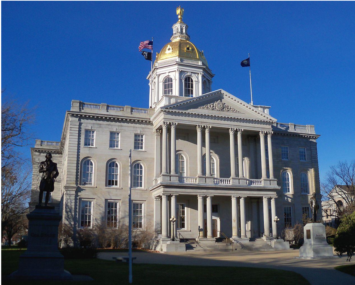
New Hampshire State House, 2012