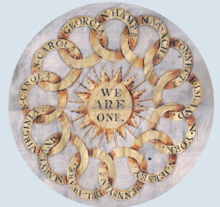
Detail of the national flag