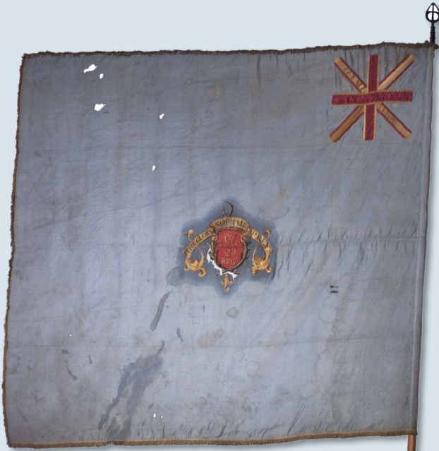
This flag was the official flag of the regiment.