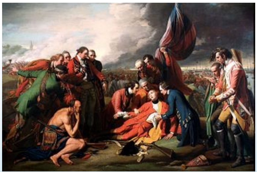
This painting is called The Death of General Wolfe . It was painted by an American artist named Benjamin West, who wanted to show what happened when a famous British general named James Wolfe died in battle during the French and Indian War.

Some Native American tribes fought as allies of the French, and some Native American tribes fought as allies of the British.