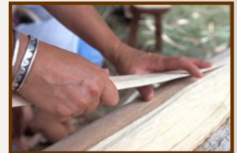
Alice Ogden loosens a thin piece of wood to create a splint, which could be used to make a basket.