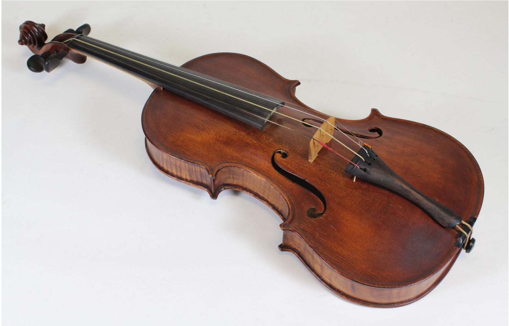
Ferdinand Picard's Violin Source: New Hampshire Historical Society