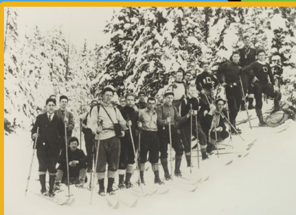
Skiing , one of New Hampshire's favorite winter activities, came from immigrants from Sweden and Norway.