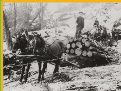
Immigrants worked as loggers , cutting down trees for building and making paper.

Immigrants who came to New Hampshire during the Great Wave made an impact that has lasted until today.