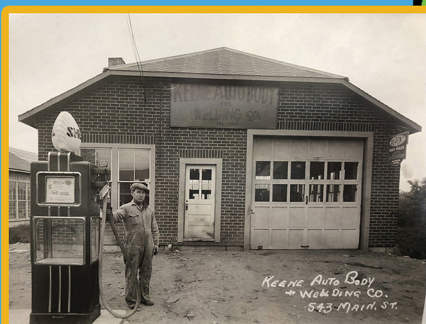
Immigrants started lots of small businesses around the state that still exist today, like Keene Auto Body , which was started by a Finnish immigrant and is still owned by his grandson.