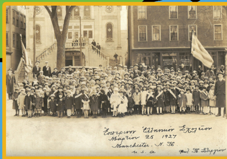
Immigrants had an impact on food in New Hampshire. So many people from Greece came to New Hampshire that we have lots of places that serve Greek pizza !