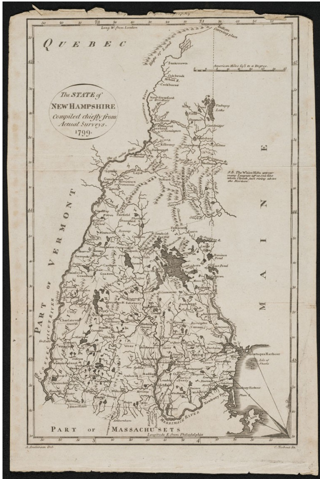
Map of New Hampshire, 1761

Maps can be used to show all kinds of physical features like borders, rivers, mountains, cities, and roads. Maps also change over time as people learn more about the world around them.